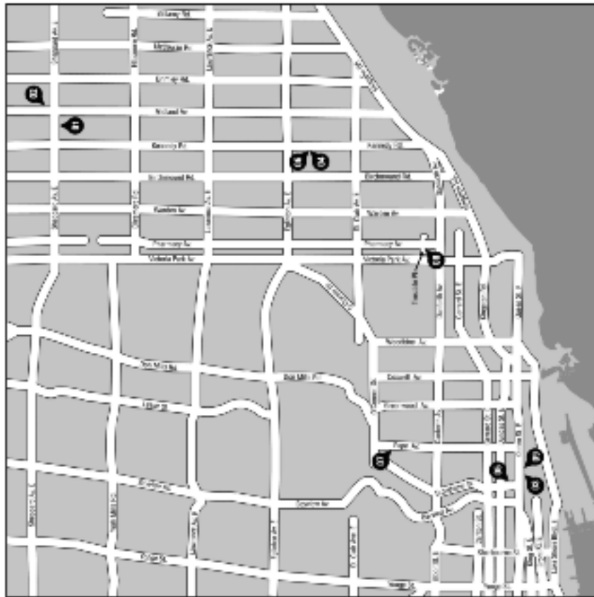
*58 Women's Harm Reduction Drop is located at 4212 Kingston Road (nearest major intersection - Kingston Road & Lawrance Avenue East)